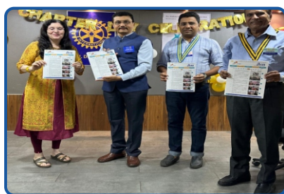
Launching of "SEVA"