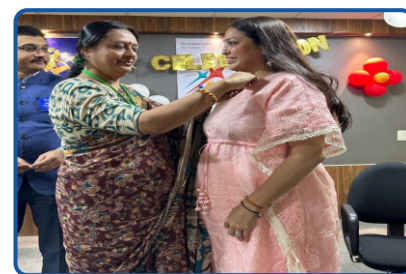
New Member Induction