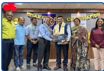
Felicitation of DGN